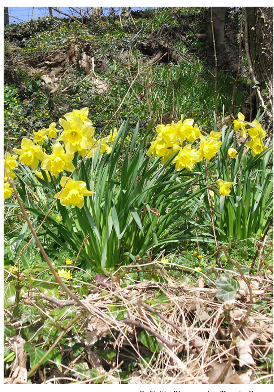
Daffodils Photograph - Timothy Fox