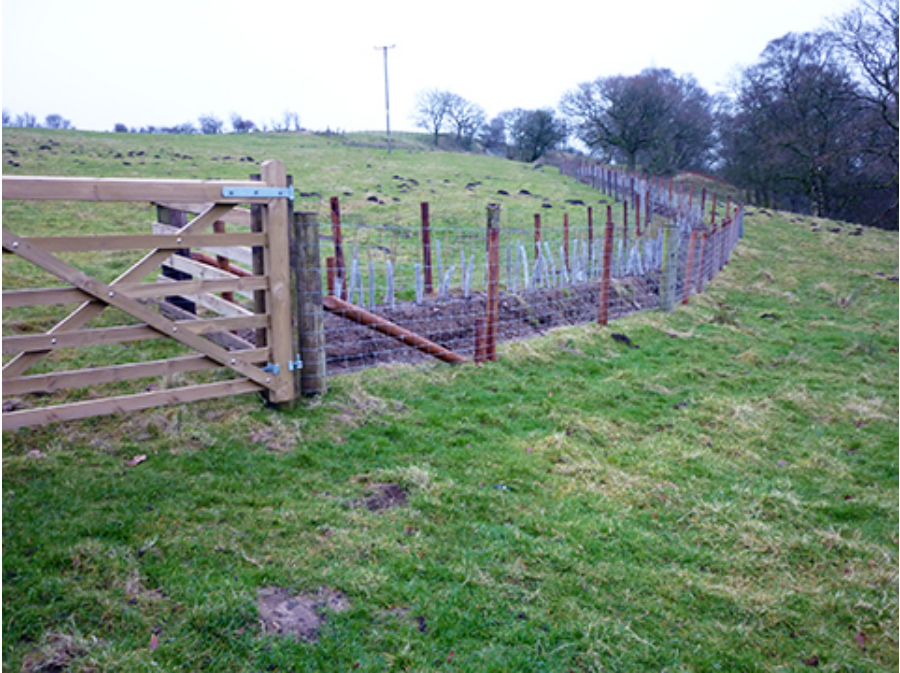
The New Hedge

Some farmers may choose to replace the Basic Payment by intensifying production but many, especially hill farmers, will probably continue to increase their income from environmental and public-engagement schemes.