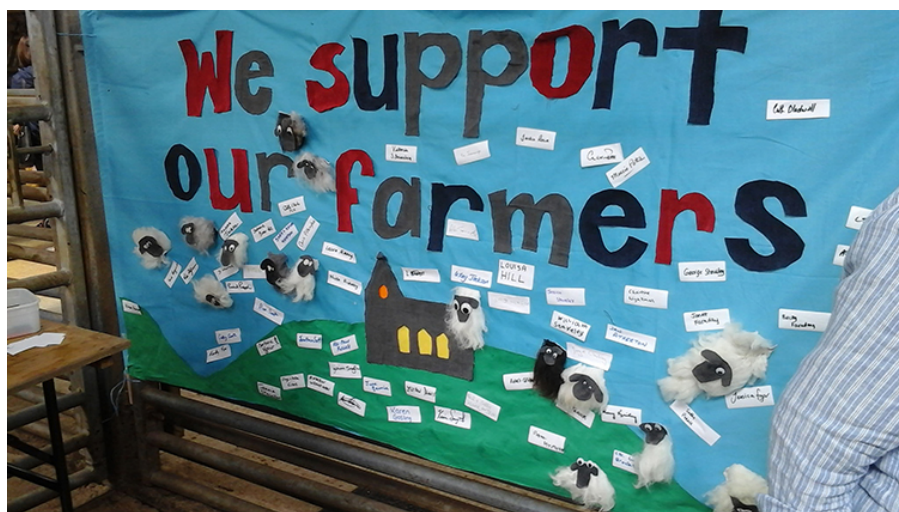
This banner was made at the Bentham Show as a sign of our support for our farmers.

In the beginning, God created the heavens and the earth... And God saw that it was good.... Genesis 1